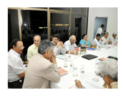
Academic Council Meeting in progress

The 4th Meeting of the Academic Council of the Central University of Himachal Pradesh was held on 9th April, 2012 at 11:30 AM in Seminar Hall-I, India International Centre, 40-Max Mueller Marg, New Delhi.